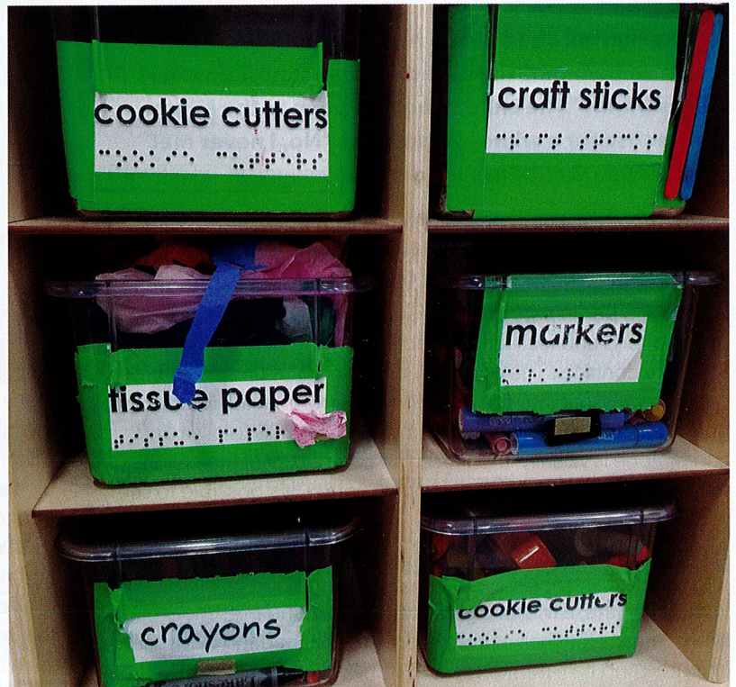
In addition to using real objects on labels for items, the labels in this classroom also include the name of the object: in words and in Braille.