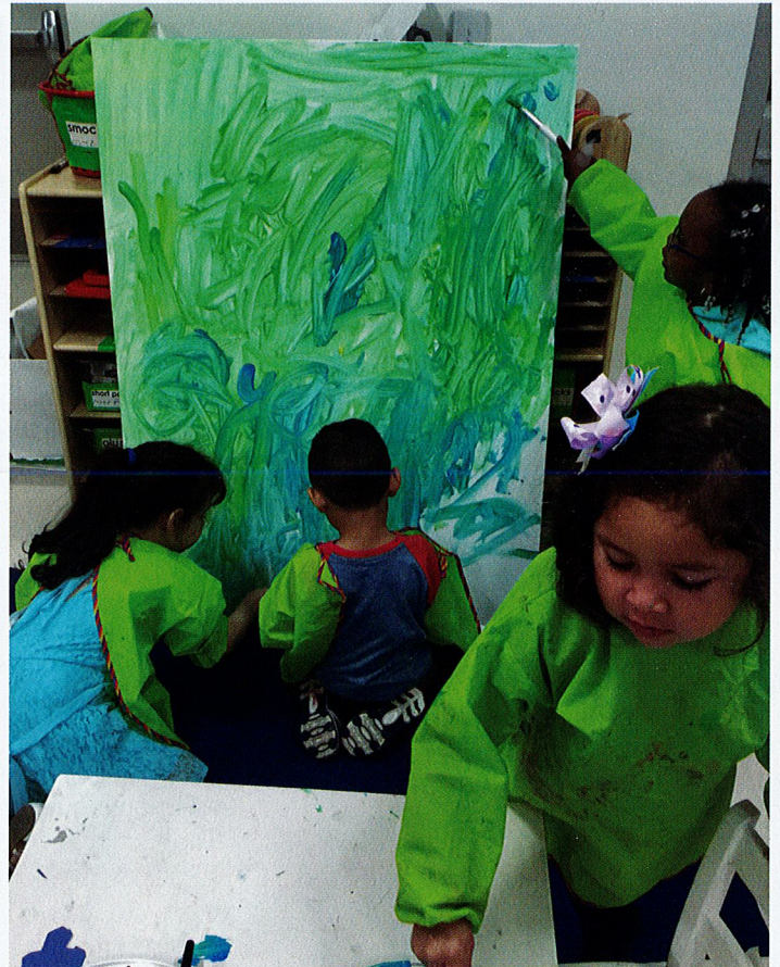
Teachers in this program emphasize sensory materials, as illustrated here, where the children are creating a large art mural with finger paint and brushes.