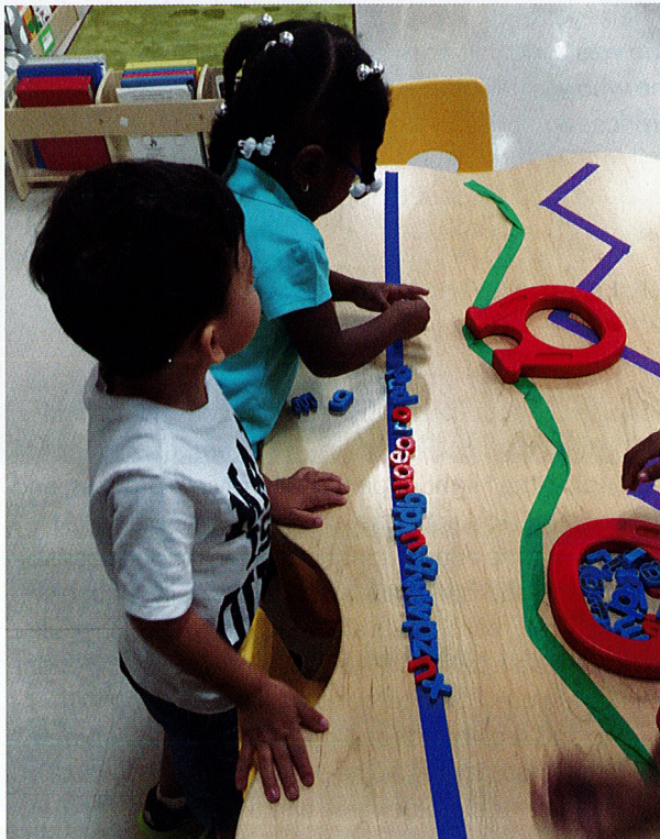
At Miami Lighthouse, visually impaired or blind children work alongside sighted children and learn that each person has different strengths and abilities.