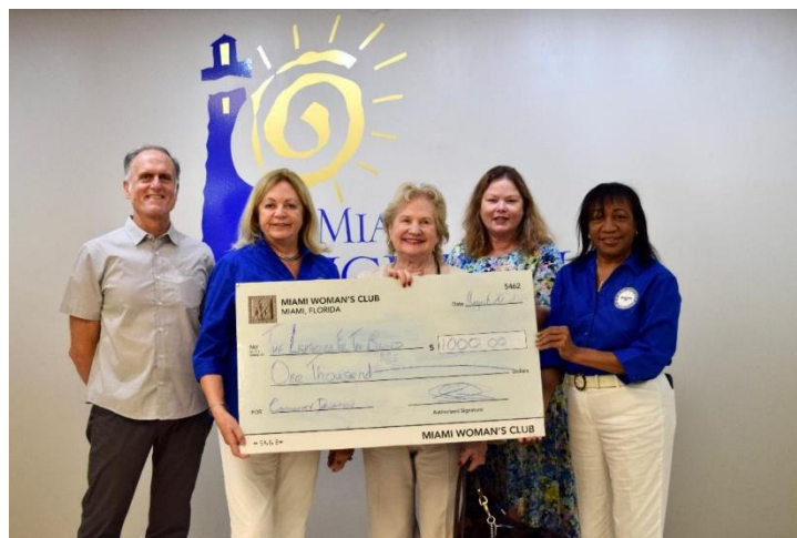
The Miami Women's Club presents check to support seniors who are blind

Our warmest thanks goes out to the Miami Women's Club once again for making a very generous monetary donation to Miami Lighthouse. This gift will go a long way towards enabling our seniors to continue engaging their creative abilities. The donation will be used to purchase much needed art supplies, such as, large and medium size canvases, macramé cords, beads and gem stones, colorful markers, paint and paint brushes. We look forward to posting examples of our seniors' remarkable artistic work in the near future.