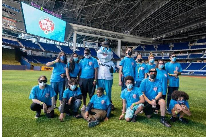
Our teenage summer camp students attend the tour and game with Billy the Marlin

As part of the Miami Marlins Impact Week presented by UKG our teenage students visited loanDepot Park for a Beep Ball game on the field and special Touch Tour which allowed them to feel, smell and hear different aspects of a baseball game. To read more, click here .