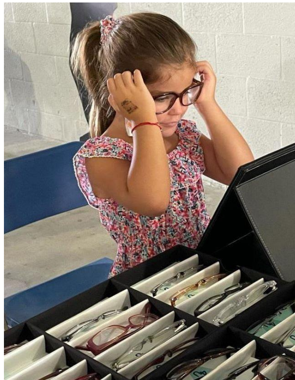
Student chooses her favorite frame from our Florida Heiken Children's Vision Program

August is Children's Eye Health and Safety Month. Miami Kids Magazine and our Florida Heiken Children's Vision Program recently provided free eye exams and glasses for financially disadvantaged students as part of Back to School celebrations. Over 50 schoolchildren received a comprehensive eye exam with dilation. By receiving prescribed glasses these students in need are getting the best chance at academic success this school year. We thank Miami Kids Magazine for their marketing efforts and for helping students get back to school and ready to learn.