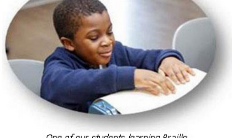
One of our students learning Braille.

The Miami Lighthouse summer will kick off June 10th to June 17th with a STEM Science Camp week for kids ages 5 to 13 that are enrolled in our year-round Braille and Technology program, sponsored in part by Division of Blind Services.