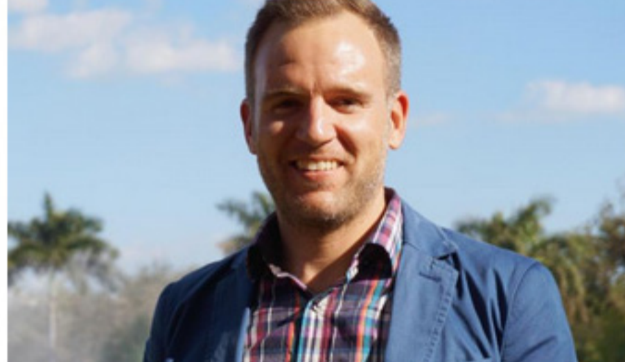
Miami Lighthouse Manager of the Better Chance Music Program